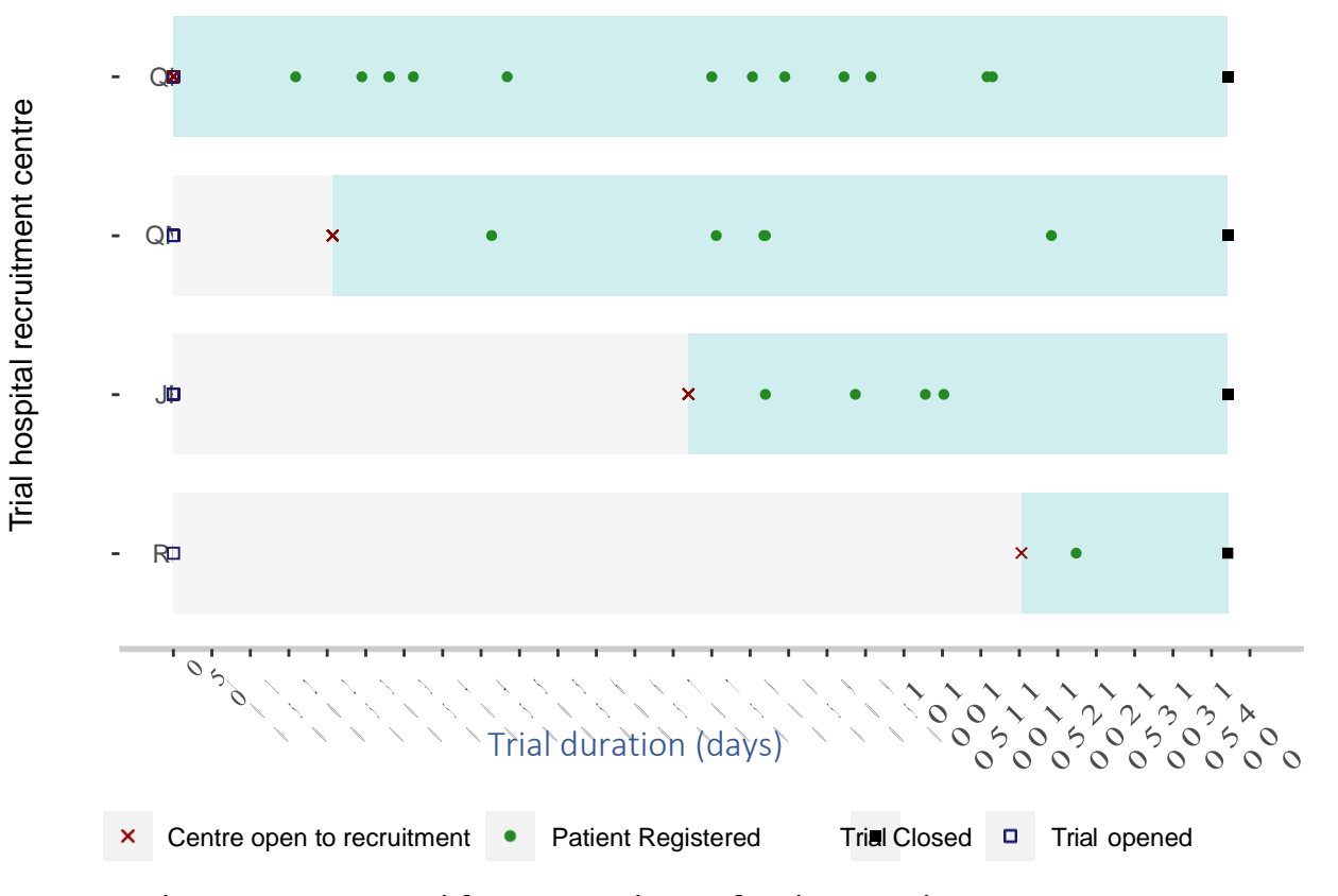
Figure S4: BUTEO Trial centre openings and patient recruitment.