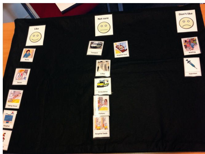
Example of one participant's completed Talking Mats™ exercise

Hospital [photograph of the appropriate hospital or simple image of a hospital]