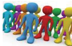
150 children to start wearing clothing in 6 months

If you agree to take part, you would be asked to come to the clinic 4 times – once at the start of the trial and then 2, 4 and 6 months later. At the clinic you would have your eczema examined by a research nurse. The nurse would not be told whether you had been wearing the silk clothing so that they would not be swayed by knowing that you had or had not been wearing the clothes.