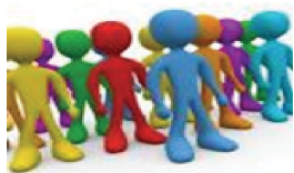
150 children to start wearing clothing now

In order to make the study as scientific as possible, a computer will decide who will wear the clothes right away and who will wear them after 6 months. You would have an equal chance of being asked to start right away or start after 6 months.