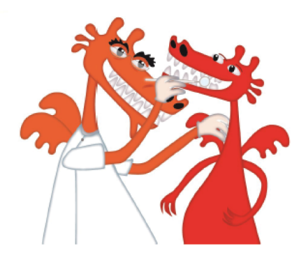
Issue #3 - Autumn 2015